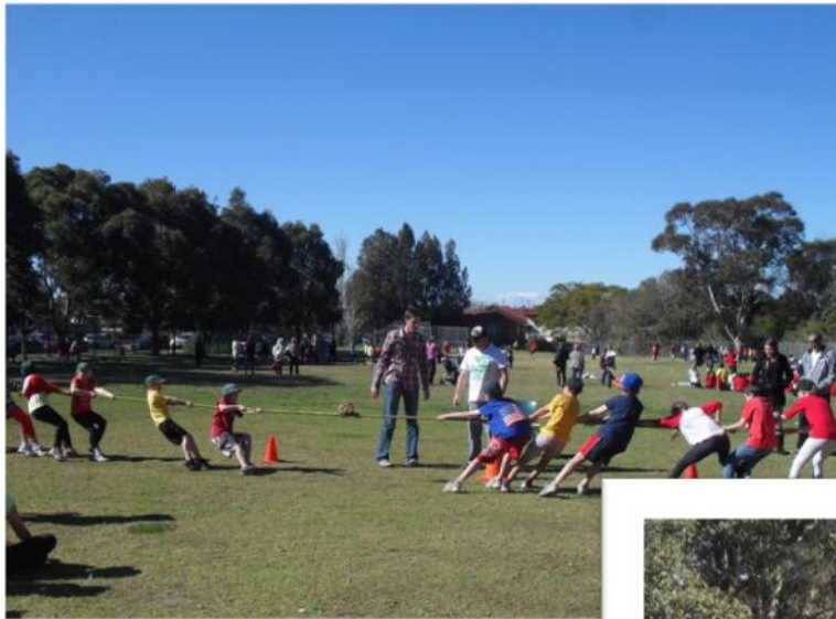
Tug O War