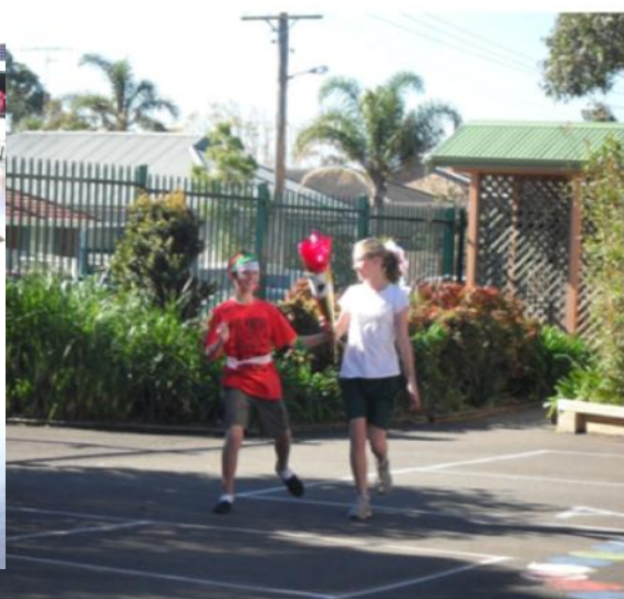
The Torch Arrives!